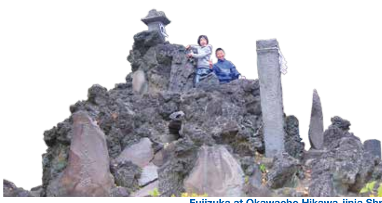
Fujizuka at Okawacho Hikawa-ijnia Shring

Mt. Fuji has been attracting the interest for the registration for the world heritage. Senju is one of the town of Mt. Fuji. There are many beautiful pictures of Mt. Fuji in Sento shown on the cover, and three Fujizuka (Fuji mound). The faith in Mt. Fuji was very popular in Edo period and "Fujizuka" was constructed by lodging the molten rock and soil transferred from Mt. Fuji for the people who cannot go to Mt. Fuji directly. There used to be about 60 Fujizuka around Tokyo and three remains in Senju today. Fujizuka at Okawacho Hikawa-jinja Shrine is the oldest in the City. You still can climb up, furthermore, the opening mountain ennichi (street fair) is held.