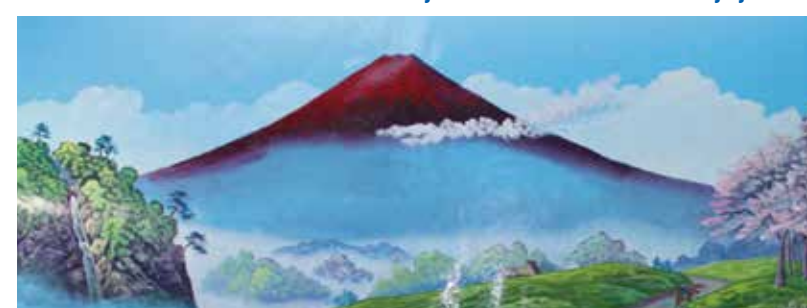
Red Fuji of Daikokuyu (in the female bathroom