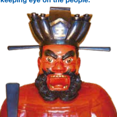
Lord Enma of Akamondera Temple

He has occupied two places, Akamon-dera Temple (Shosen-ji Temple) and Konzo-ji Temple. Enma-biraki ennichi (street fair) is held twice a year at Akamon-dera Temple and you can admire the Lord Enma. Enma of Konzo-ji Temple is not open for public, but legend has it that he was made up as a girl to have soba (buckwheat noodle) every night, a cute "Soba Enma".